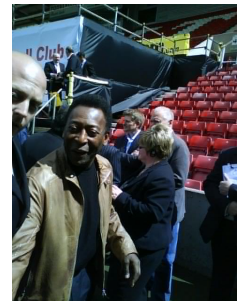
Final at Old Wanderers '01, '14.