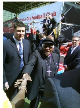
'96 & '97, internationaling parade for